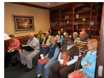
2011 Spring Fling

Comment from Board member- "What a fantastic evening! I am so glad I could make it. Elite is an excellent property management co. We are so lucky to have you as our partner. Thanks!