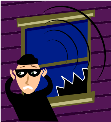
Does your community have a healthy Community Watch Program?